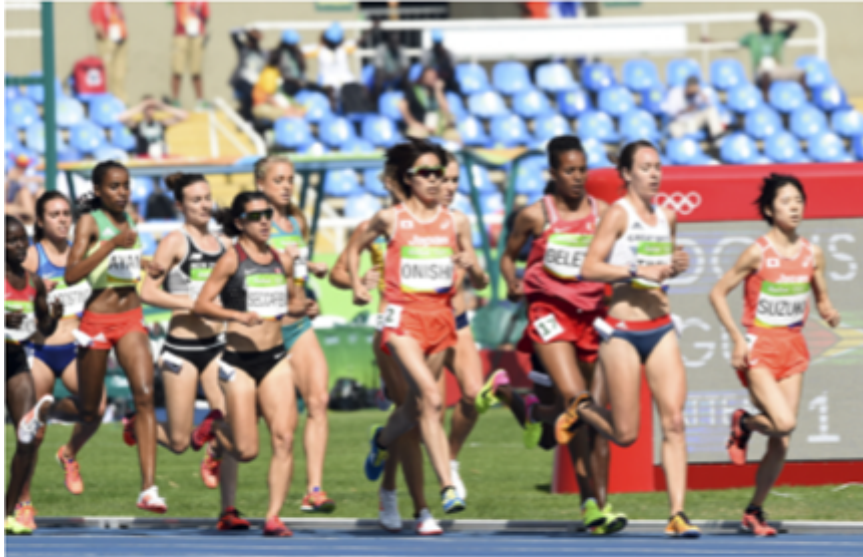
Figure 4: Olympics 2016, women's 5000 metres heat. D'Agostino and Hamblin settle into the field before the latter stumbled and the former lent a sporting hand.

participate in sport as players, fans, coaches and administrators.