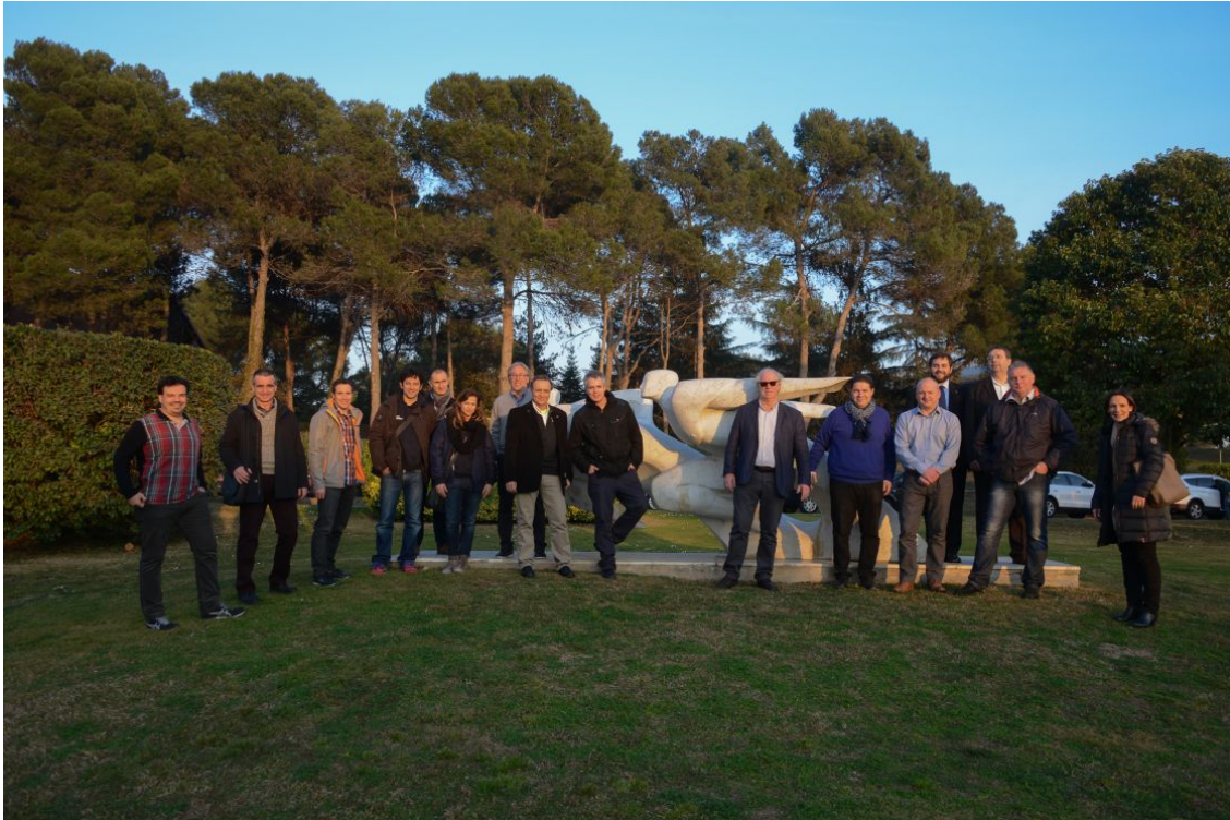
Image: The E4S Team members in Sant Cugat de Valles January 2016